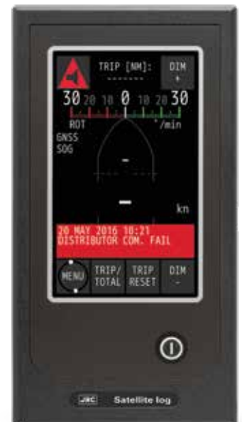
Alert content bar